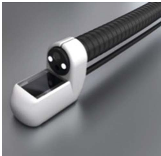
► Fig. 1 EndoVE (source: Cork Cancer Research Centre). Images of the device used in the trial- EndoVE®. The electrode is attached to an endoscope. Tumor tissue is captured in place within the chamber ( 1 \times 1 \times 1.5 \text{ cm} ) of the device by a vacuum; this brings the tumor in contact with the two parallel electrodes which deliver pulses in 100 \mu\text{s} intervals. The procedure is repeated until the whole tumor area is covered.

The protocol allowed for inclusion of eight patients. Since the primary endpoint was safety in this phase I first-in-man trial, the subject number was low. Only patients ineligible for potentially curative intended surgery were candidates. Inclusion criteria were: age \geq 18 years, histologically verified malignant esophageal tumor (adenocarcinoma or squamous cell cancer), expected survival time \geq 3 months, WHO performance status \leq 2 [18], platelets \geq 50 billion/L, International Normalized Ratio < 1.5 (medical correction was allowed), and s-creatinine < 150 \mu\text{mol/L} . Moreover, patients had to have locally progressive disease despite previous treatment with chemoradiotherapy or locally progressive disease despite previous treatment with palliative radiotherapy and not be candidates for systemic chemotherapy. Written informed consent was required. Exclusion criteria were: non-correctable coagulation disorders, clinically significant cardiac arrhythmias, pregnancy or lactation/breast-feeding, concurrent treatment with another investigational medicinal product, contraindications for use of bleomycin (acute pulmonary infection, severe pulmonary disease, previously allergic reactions to bleomycin, or a previously regimen