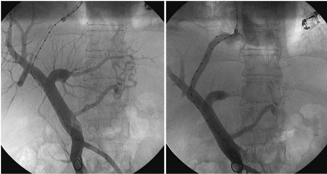
► Fig. 3 Left image: after a guidewire is introduced, the needle is exchanged for a calibrated catheter for diagnostic purposes and pressure measurements. Right image: Control study after TIPS placement and balloon dilatation.