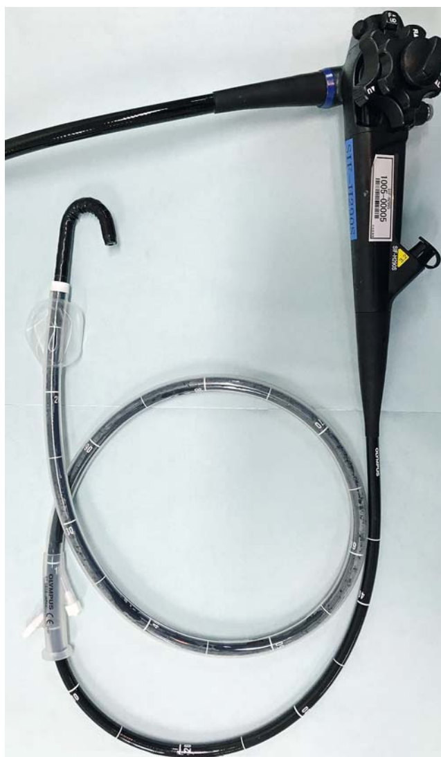
▶ Fig. 1 Newly designed short-type single-balloon endoscope (short SBE) (SIF-H290S) with a sliding tube.