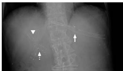
► Fig. 1 Radiographic image following endoscopic ultrasound-guided biliary drainage performed 3 months previously for hilar biliary obstruction due to recurrent pancreatic cancer after pancreaticoduodenectomy. Two metal stents were used in the procedure: one was inserted into the hilar biliary obstruction site to bridge the right and left hepatic ducts (arrowhead); the second was placed from intrahepatic bile duct segment 2 to the stomach (arrow). The length of the intra-gastric portion of the stent was about 7 cm. The dotted arrow shows a metal stent placed for afferent loop syndrome.

Stents must be of a sufficient length to prevent their migration into the abdominal cavity after endoscopic ultrasound-guided hepaticogastrostomy (EUS-HGS) [1,2]. Although a self-expandable metal stent (SEMS) with a long intragastric portion can occasionally migrate to the esophagus, this hardly ever leads to severe complications. However, we present here a case of mediastinitis due to perforation caused by a SEMS.