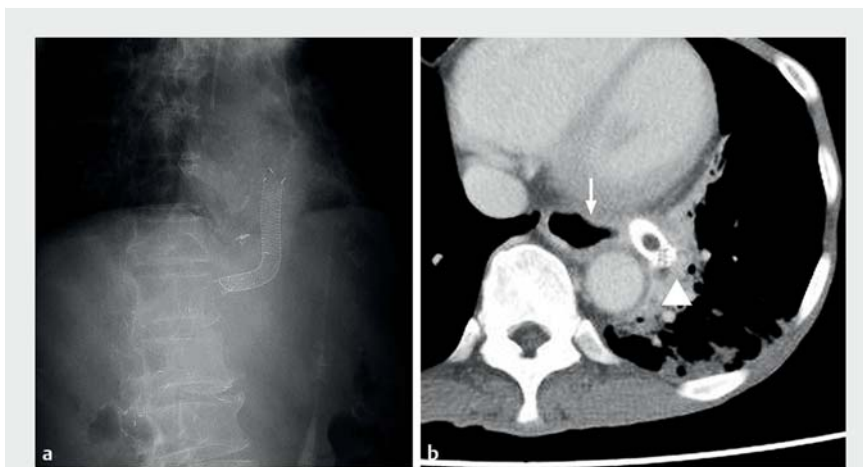
► Fig. 2 The migrated metal stent is revealed on: a a radiographic image showing an intra-gastric portion of the metal stent pointing upward, indicating its migration into the esophagus; b a computed tomography image showing a part of the stent penetrating the mediastinum (arrowhead). An arrow indicates the esophagus.

A 75-year-old woman presented with intermittent vomiting for 2 days. She had undergone EUS-HGS 3 months previously for obstructive jaundice caused by post-resection recurrence of pancreatic head cancer (► Fig. 1 ). The EUS-HGS had been performed from the stomach to intrahepatic bile duct segment 2 using a covered SEMS that was 8 mm in diameter and 12 cm in length (bare-end, Niti-S biliary S-type; Taewoong Corporation, Seoul, South Korea). A computed tomography (CT) scan demonstrated that the SEMS had perforated the mediastinum beyond the digestive tract wall (► Fig. 2 ).