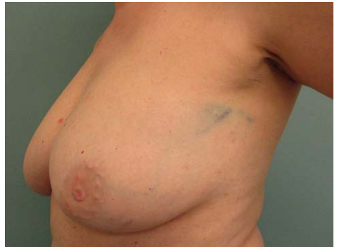
► Fig. 2 Permanent undesirable skin tattooing after carbon marking of the TLN.

After the PST additional marking of the TLN immediately before surgery is not necessary. After incising the skin and opening the axillary fascia, the grey to black marked perinodal tissue and the TLN are sought purely visually and removed (► Fig. 3 ). In patients with body tattoos on the upper body, detection of the iatrogenically tattooed lymph node can be more difficult if other lymph nodes are pigmented as a result of the cosmetic skin tattoo. A distinction is usually possible, however, as the perinodal tissue is pigmented only after TLN, so that a body tattoo is not an absolute contraindication to TLNB after carbon marking (► Fig. 4 ).