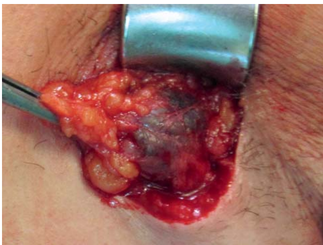
► Fig. 4 Pigmented axillary SLN after cosmetic tattoo on the upper arm. (The perinodal tissue is not pigmented, unlike TLNB after iatrogenic lymph node tattooing.)

at least one tattooed lymph node was found at operation. The concordance rate of SLN and tattooed lymph nodes was 75.7%, and the FNR was not obtained as ALND was performed in only 24 subjects. The authors report that small foci of pigment deposits were visible in other lymph nodes on microscopy in 45% of the patients in the study in addition to the macroscopically visible tattooed lymph nodes. It must therefore be assumed that a certain migration of the carbon solution into other lymph nodes can take place. Microscopic detection of pigment alone (i.e., not visible with the naked eye) can therefore not be regarded as evidence of successful removal of the TLN [20]. The prospective study by Patel et al. included the 12 patients from the pilot study by Choy et al. referred to above [17] in addition to the 47 patients who received