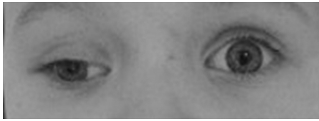
Fig. 1 Patient 1 week after stroke: the picture shows the ipsilateral oculomotor nerve palsy on the right (gaze down and out, dilated pupil).

for 5 days. Due to delayed improvement immunoglobulins (2 g/kg over 2 days) were administered secondly because of the possibility of Bickerstaff encephalitis. When steroids and immunoglobulins failed to produce a therapeutic breakthrough and MRI on day 10 showed demarcation in mid-brain, we considered it to be occlusion of the small arteries. The patient subsequently received acetylsalicylic acid (ASA) for secondary stroke prophylaxis. The initial diagnostic tests did not show any anomalies, apart from detectable oligoclonal bands in the cerebrospinal fluid. Subsequent genetic testing revealed the cause. Single exome sequencing identified two compound heterozygous variants in the ADA2 gene: the likely pathogenic variant c.158del, p.(Asn53Thrfs*12) based on the American College of Medical Genetics and Genomics criteria 13 and the variant of unknown significance (VUS) variant c.2T>A, p.(0?). Compound heterozygosity could be determined from single exome sequencing due to the close proximity of the variants (► Supplementary Fig. S1 , available in the online version only). The extended diagnostic workup revealed a severe deficiency of plasma ADA2 enzyme activity of 0.0 mU/g protein, as measured in extracts of dried plasma spots as described in Ben-Ami et al. 14 The patient also