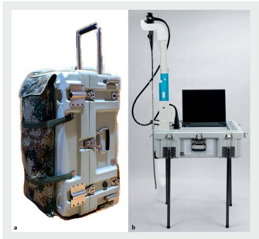
► Fig. 1 The portable endoscopy system. a In transportation status. b In working status, covered by a disposable sheathed system.

Only one portable GI endoscopy system currently exists (E.G. Scan; IntroMedic Co., Ltd., Seoul, Korea), but this is diagnostic only without any treatment function [4]. Our system has both diagnostic and treatment capabilities. Besides the portability of this system, another ad-