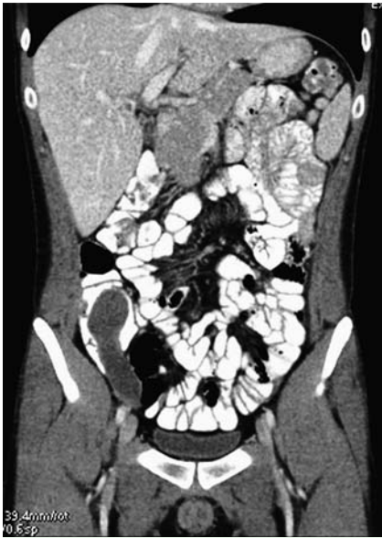
Fig. 1 Computed tomography (CT) image showing a 10 × 3.5-cm oval neoplasm with well-demarcated, thin walls in the appendiceal region in contact with the ascending colon.

A 22-year-old man was admitted because of abdominal pain localized to the right iliac fossa. An abdominal ultrasound scan was performed, which revealed a 3.5 × 8-cm mass with heterogeneous content and calcified walls in close proximity to the ascending colon. A computed tomography (CT) scan of the abdomen showed a 10 × 3.5-cm mass in the region of the appendix with homogeneous density, thin walls, and some small areas of calcification (▶ Fig. 1 ). A colonoscopy was subsequently performed,