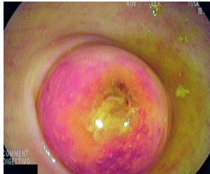
Fig. 2 Colonoscopic view showing a submucosal lesion protruding from the appendiceal area with the typical “volcano sign” and erythematous mucosa.

A 22-year-old man was admitted because of abdominal pain localized to the right iliac fossa. An abdominal ultrasound scan was performed, which revealed a 3.5 × 8-cm mass with heterogeneous content and calcified walls in close proximity to the ascending colon. A computed tomography (CT) scan of the abdomen showed a 10 × 3.5-cm mass in the region of the appendix with homogeneous density, thin walls, and some small areas of calcification (▶ Fig. 1 ). A colonoscopy was subsequently performed,