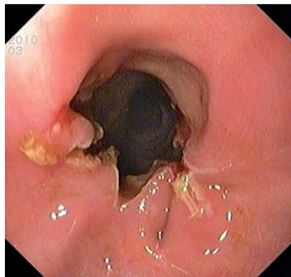
Fig. 2 The widened lumen of the stricture after incisional treatment.