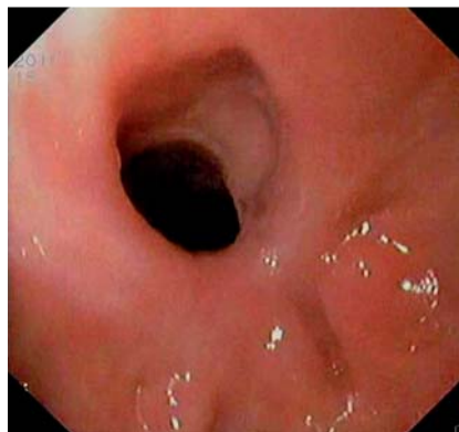
Fig. 1 Fibrotic esophageal stricture before incisional treatment, in a 44-year-old man who accidentally ingested sodium hydroxide solution.

Benign esophageal strictures are often difficult to treat and the currently practiced dilation techniques are equally effective [1]. Treatment with needle-knife incision has been described [1–3] for benign esophageal strictures as a fast, easy, and