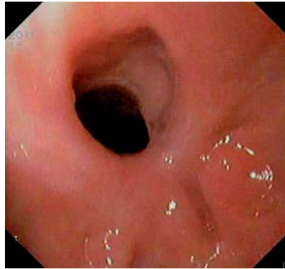
Fig. 1 Fibrotic esophageal stricture before incisional treatment, in a 44-year-old man who accidentally ingested sodium hydroxide solution.

Benign esophageal strictures are often difficult to treat and the currently practiced dilation techniques are equally effective [1]. Treatment with needle-knife incision has been described [1–3] for benign esophageal strictures as a fast, easy, and