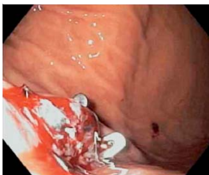
Fig. 2 Deployment of the over-the-scope clip.

ferent indications with the over-the-scope clip, including hemostasis and perforations [5]. The primary treatment was successful in all cases, including one gastric Dieulafoy. The over-the-scope clip may have the potential for being part of the routine armamentarium for endoscopic control of large vascular ectasias.