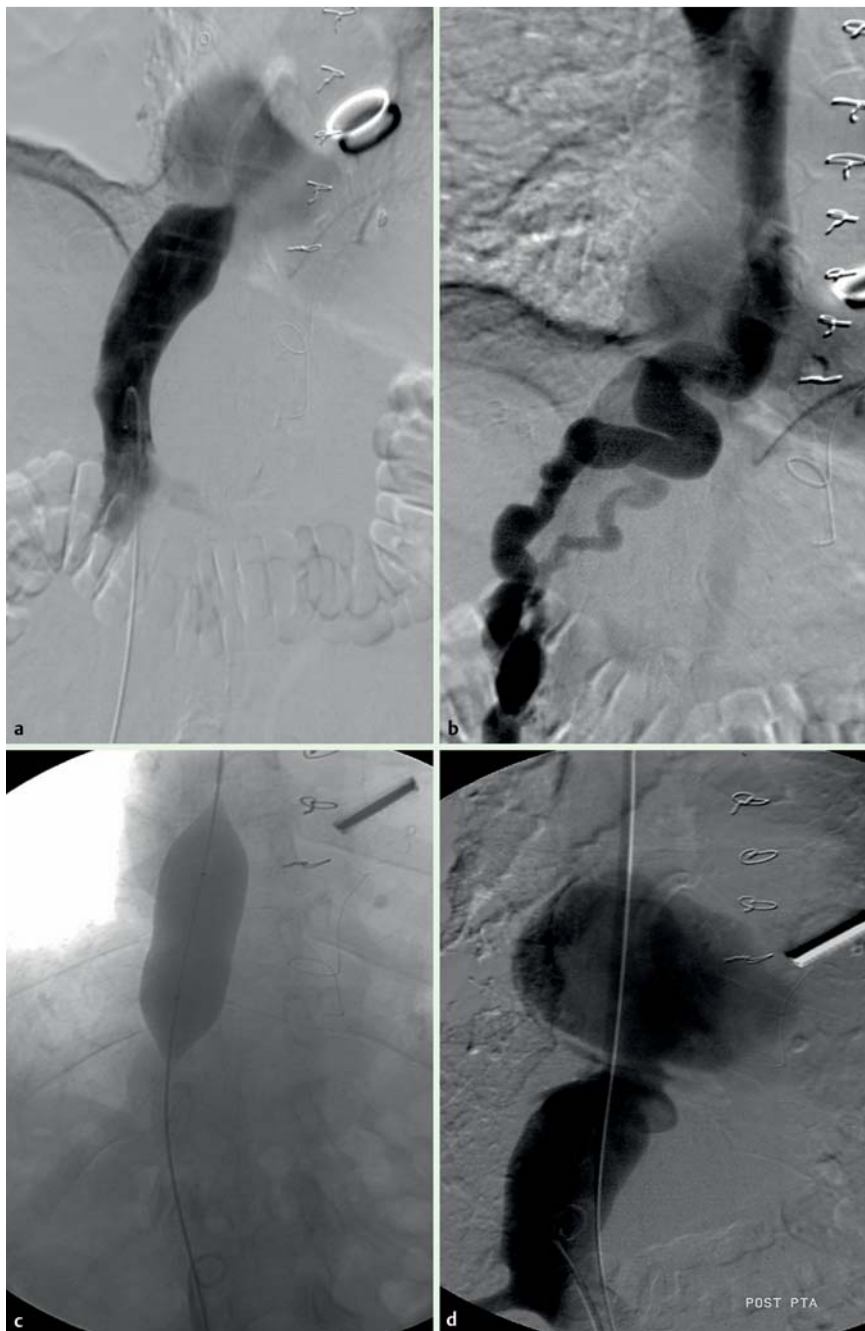
Fig. 3 Images taken during percutaneous thoracic angiography (PTA) showing: a a marked degree of stenosis related to the web seen at the atriocaval junction during imaging of the inferior vena cava; b reflux of contrast into the hemiazy-

gos-azygos venous system during the late phase and varicosity in the azygos vein; c dilation of the atriocaval web being performed with an angioplasty balloon; d improvement in the stenotic segment following the PTA procedure.