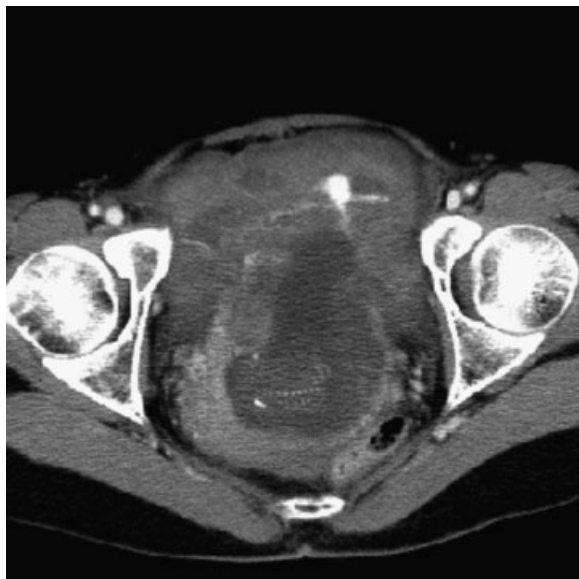
Fig. 2 Dynamic computed tomography revealing discontinuity of the uterine muscle layer in the lower uterine segment.

While the patient was being prepared for emergency laparotomy, her blood pressure suddenly decreased to 78/51 mm Hg and her heart rate increased. Therefore, aggressive resuscitation for hypovolemic shock was required. At the time of the operation, uterine rupture with complete opening of the uterine wall at the site of the previous transverse scar was found (►Fig. 3). The fetus within the amniotic sac showed no cardiac activity and was located in a blood-filled abdominal cavity. The total amount of the hemorrhage in the abdominal cavity was approximately 3 L. After the fetus and placenta were removed, the uterine scar was repaired using a double-layer closure. During the preoperative, intraoperative, and postoperative periods, the patient received a total amount of 10 units of packed red blood cells and 6 units of fresh frozen plasma for the resuscitation. She recovered without any complications and was discharged on the eighth postoperative day.