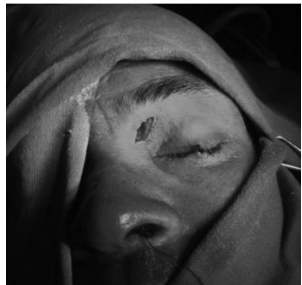
Fig. 4 Operative picture of the incision used for frontal trephination.

The frontal sinus was opened by making a small stab incision halfway between the medial canthus and brow (frontal trephination) (►Fig. 4). The opening was further enlarged with a cutting burr large enough to accommodate