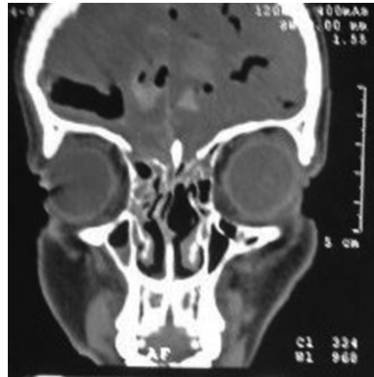
Fig. 3 Coronal computed tomography scan showing pneumocephalus due to frontal sinus cerebrospinal fluid leak.

area was confirmed. Because all these patients were post head injury cases, frank CSF leakage was seen from that area. Before proceeding to the procedure, we classified the defects of the frontal sinus radiologically as small and large defects, with a cut-off of 0.5 cm. Defects located inferiorly in the frontal sinus and near the frontonasal duct area are usually repaired endoscopically, and those located higher up in the posterior table are dealt with using a conventional extracranial obliteration method. At our center we mainly target defects of the posterior table that cannot be adequately approached via the nasal endoscopic route and would require extracranial repair. The size of the posterior frontal table defect taken on for endoscopic repair was approximately up to 0.5 cm.