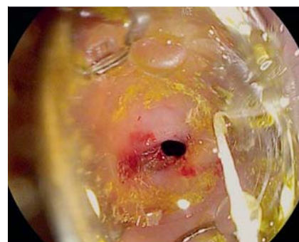
Fig. 2 The perforation was positioned within the cap of the over-the-scope clip (OTSC).