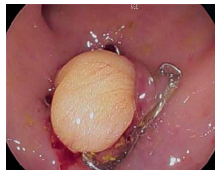
Fig. 4 A polypoid intraluminal yellowish structure was seen after closure of the colonic perforation with the over-the-scope clip (OTSC).