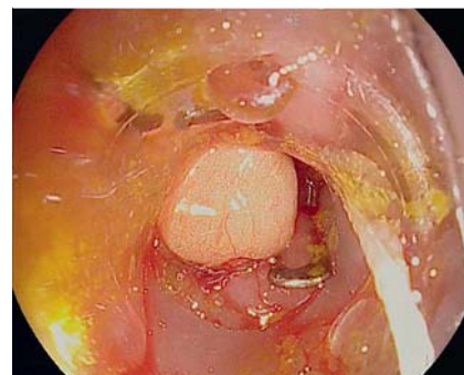
Fig. 3 Complete closure of the colonic perforation with the over-the-scope clip (OTSC).