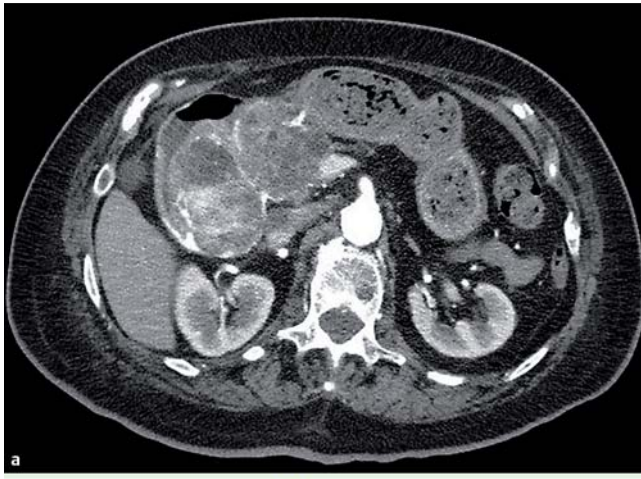
Fig. 1 An 84-year-old woman was admitted with melena. a CT imaging revealed a complex cystic pancreatic head mass with multiple internal septations. b CT angiography reconstruction imaging showed a large hypervascular pancreatic lesion.