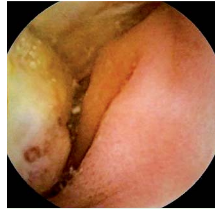
Fig. 2 Endoscopy revealed ulceration consistent with duodenal invasion.

An 84-year-old woman was admitted with melena. She had had an enlarging pancreatic mass 2 years earlier requiring endoscopic retrograde cholangiopancreatography (ERCP) with sphincterotomy and biliary metal stent placement. Her current presentation included melena for 1 week. She did not have any pain, nausea, vomiting, abdominal fullness or weight loss. Vital signs were within normal limits. On physical examination, mild epigastric tenderness was present. Laboratory studies revealed hemoglobin of 6.6 g/dL, a normal comprehensive metabolic profile, and nor-