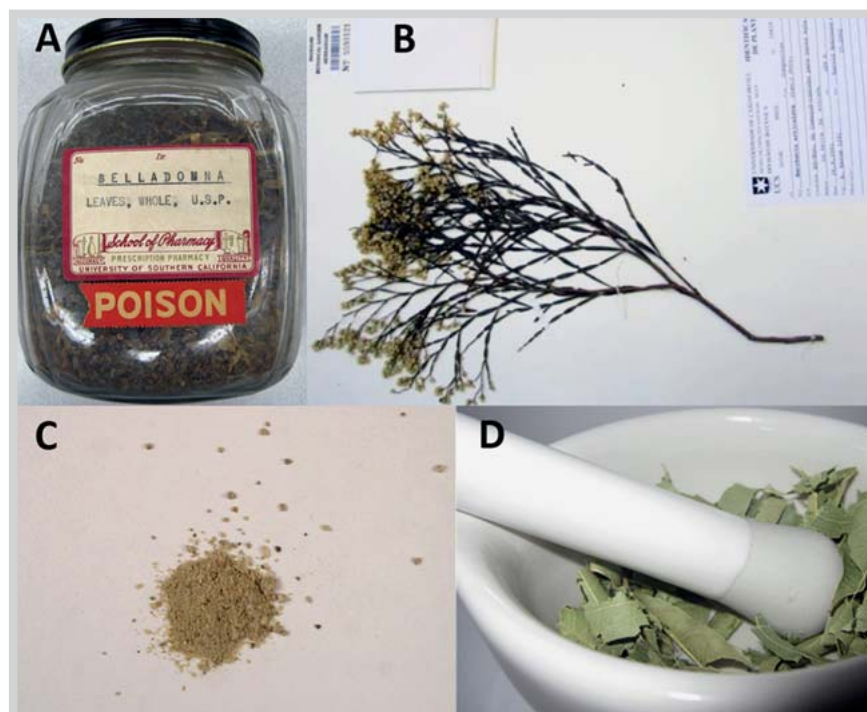
Fig. 1 Examples of the types of plant material used for isolation of DNA and authentication. A Bottle of Atropa belladonna dried leaves, originally from the University of Southern California Pharmacy School. Photo, A. M. Hirsch. B Specimen of Baccharis articulata from the Missouri Botanical Garden Herbarium. Photo, D. C. F. Moraes. C Powder derived from Hoodia gordonii . Photo, M. R. Lum. D Plant material of Baccharis genistoides prior to DNA extraction. Photo, D. C. F. Moraes. (Color figure available online only.)

ments and remedies, and Asia-Pacific and Japan make up the other important markets for these products [7].