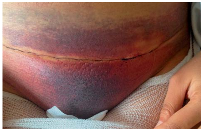
Fig. 2 Haematoma in the region of the laparotomy scar on the third postoperative day after Caesarean section. Further haematomas on arms and legs.

normal amount of amniotic fluid were seen. The Doppler scan did not show any pathological findings except for a borderline elevated resistance in the right uterine artery with an intimated notch. The blood picture was dominated by an isolated 30-fold elevation of the transaminases (Table 1).