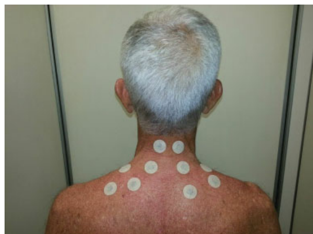
Fig. 2 Distribution of the 10 tablets containing nanotubes.

In a preliminary study conducted before this one, we noticed a decrease in pain and dizziness scores throughout two weeks of patches treatment. Therefore, we tracked out the patient on a biweekly basis. We changed the patches during the first visit, which was 15 days after the beginning of treatment. At this point, one of the subjects was excluded from the study due to patch loss. We recorded the remaining seven subjects pain and dizziness levels using the VAS on a twice week basis. A Computerized Dynamic Posturography (CPD) was performed at the end of four weeks. We plotted sex, age, pain, and dizziness scores in a table. We analyzed