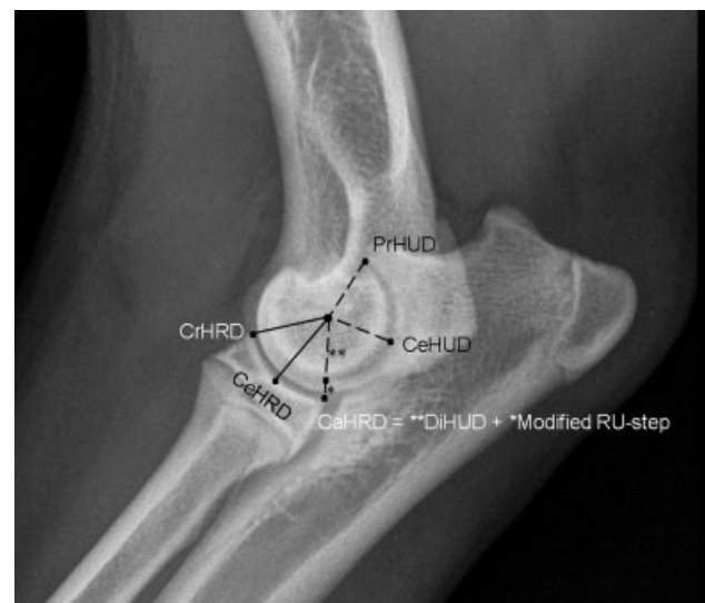
Fig. 1 Mediolateral elbow radiograph of a Labrador Retriever confirmed to have medial coronoid disease illustrating measurements of humeroradial and humeroulnar distances and modified radioulnar step. CrHRD, cranial humeroradial distance; CeHRD, central humeroradial distance; CaHRD, caudal humeroradial distance; PrHUD, proximal humeroulnar distance; CeHUD, central humeroulnar distance; DiHUD, distal humeroulnar distance; RU-step, radioulnar step. Note the subtrochlear ulnar sclerosis associated with the elbow. *DiHUD; ** modified RU-step.

Elbow joint congruity was objectively determined via calculating the absolute, average and normalized values of HR and HU distances. The humeroradial distances (HRD) represent the absolute distances between the centre of rotation of the humeral condyle and proximocranial, central and proximocaudal points created on the fovea of the radial head (cranial, central and caudal HRD, ►Fig. 1). The