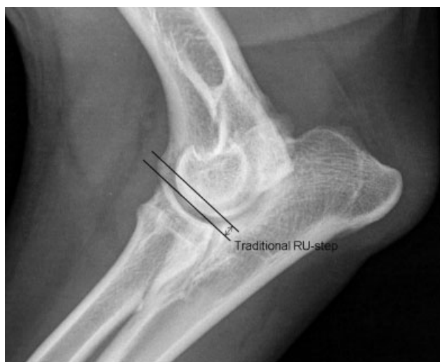
Fig. 2 Mediolateral elbow radiograph of a Golden Retriever confirmed to have medial coronoid disease illustrating measurement of traditional radioulnar step. Note the degenerative changes associated with elbow joint. RUstep, radioulnar step.

Radioulnar congruity was quantified by assessment of RU-step. The RU-step was traditionally evaluated by measuring the vertical distance between a line connecting the proximo-cranial and proximocaudal extents of the fovea of the radial head and a parallel line drawn along the lateral coronoid process (traditional RU-step, ►Fig. 2). 27-30 A modified procedure for assessing RU-step (modified RU-step) was generated in the current study by subtraction of the absolute value of the distal HUD from that of the caudal HRD. The difference between the two distances appears to represent the step between the proximocaudal extent of the radial head and the distal extent of the medial margin of the ulnar trochlear notch at the level of the base of the MCP. All measurements were performed by use of a free medical and radiological processing software (ImageJ 1.41/Java 1.6.0_21) previously utilized in veterinary orthopaedic research. 31,32 A magnifica-