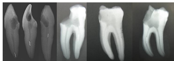
Figure 1. Radiographs showing broken instruments in different levels of curved and straight canals.

Studies showed that to remove fractured instruments successfully depends on the type of fractured instrument, the canal anatomy, the degree of canal curvature and on the specific