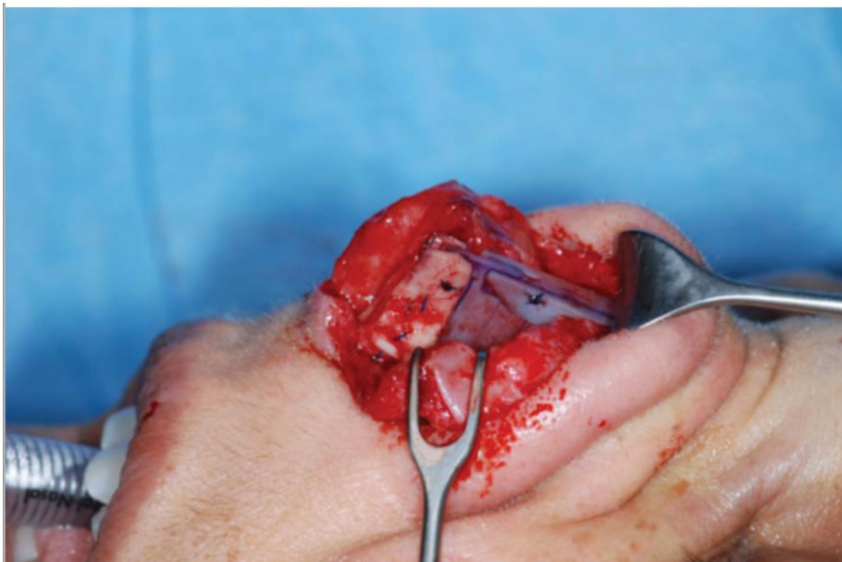
Fig. 4 Double layered conchal graft fixed to the anterior septal border.

side, then to fold these parts backward and suture the opposing convexities of the conchal cartilage to one another.