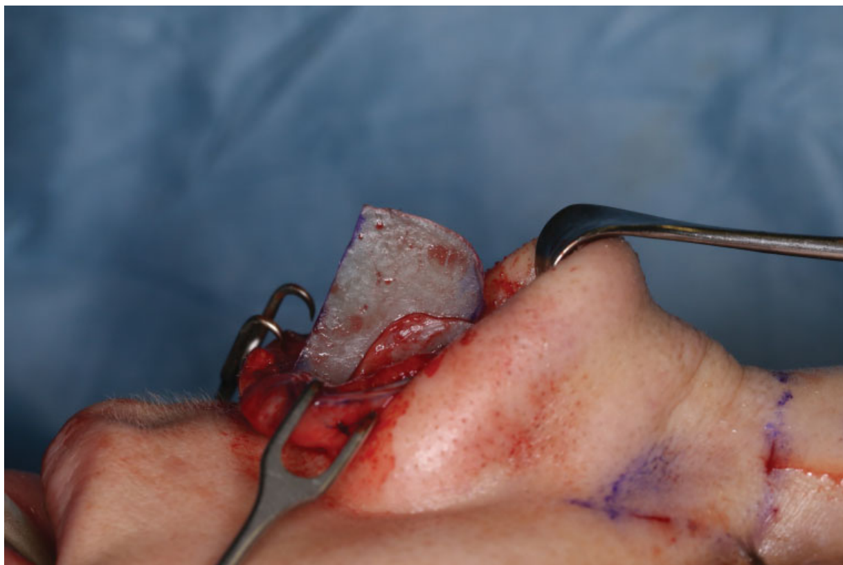
Fig. 1 Intraoperative view of a side-to-side septal extension graft.

Guyuron and Varghai proposed fixing the SEG with extended spreader grafts to the caudal septal border (→Fig. 2). This technique maintains symmetry and ensures a stable fixation.