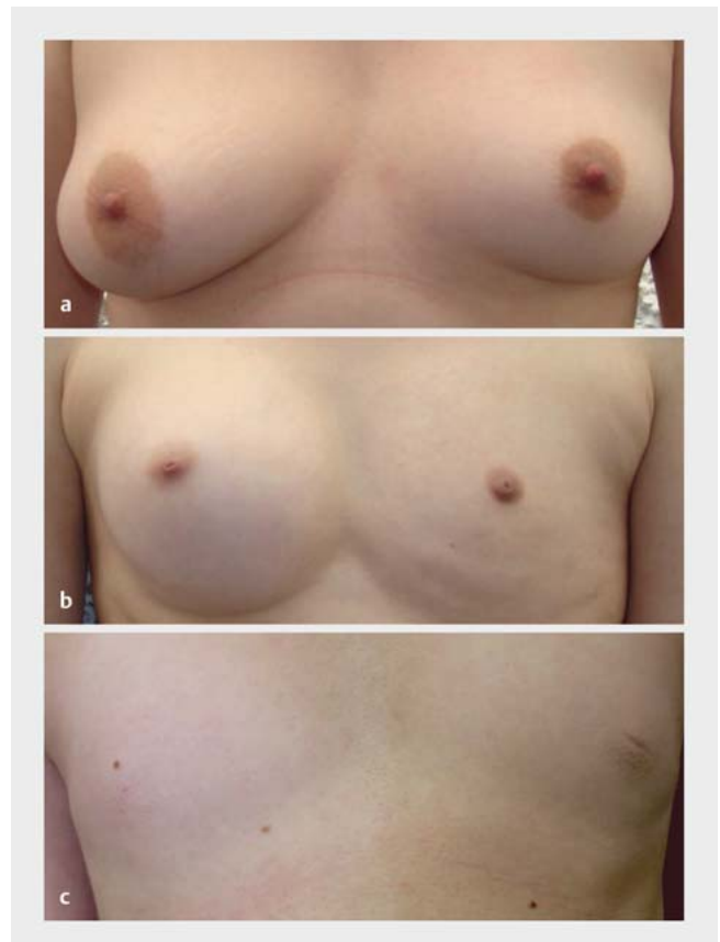
► Fig. 1 Selected images from the photodocumentation of the breast region of female HED patients. a Slight difference in the size of the breasts of one patient in Group A; b Major difference in breast sizes in a patient from the same group; c Complete absence of breasts in a patient from Group B.

58% of the women of Group A and 57% of the women of Group B described their nipples as exceptionally flat. 8% of the women had a nipple malformation which took the form of bilateral inverted (retracted or invaginated) nipples (► Fig. 1 b); the incidence was slightly higher in Group B (► Table 1) and significantly higher than in healthy women, of whom only 1% present with true inverted nipples [17]. The unilateral or bilateral presence of more than