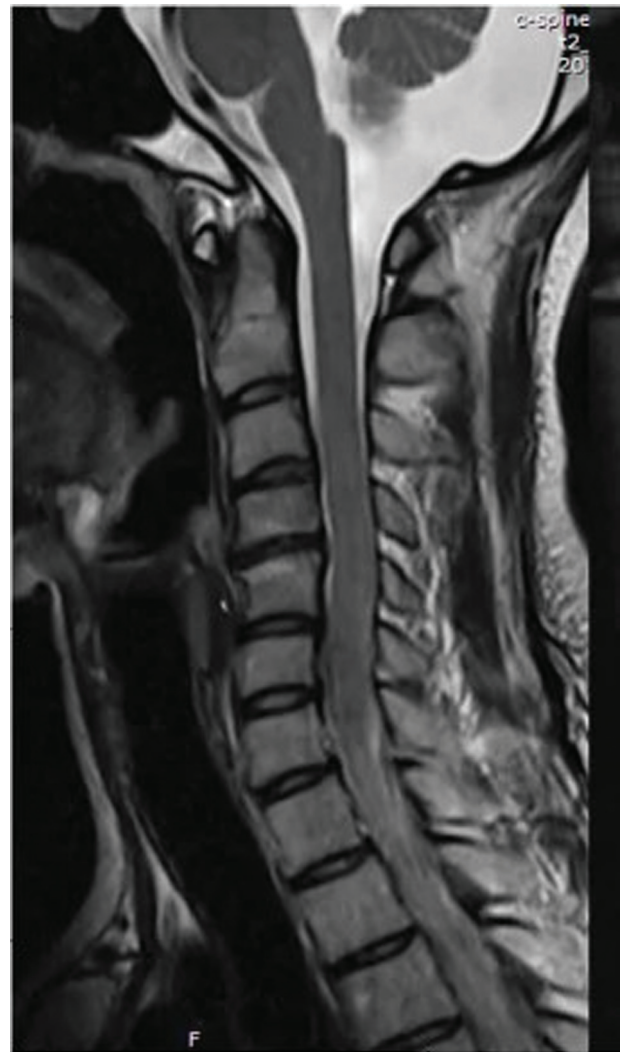
Fig. 4 Follow-up sagittal T2 MRI suggesting almost complete resolution of extradural cervical hematoma.

The patient in the present study was an 11-year old boy. This entity had been detected in all age groups with an incidence of 0.1 per 100,000 population but its presence in the pediatric population is rare and nearly 35 cases had been reported. 1-3 Next, 40% of the reported spinal EDH is spontaneous in origin and the most common site is the cervicothoracic junction followed by the thoracic region. 4