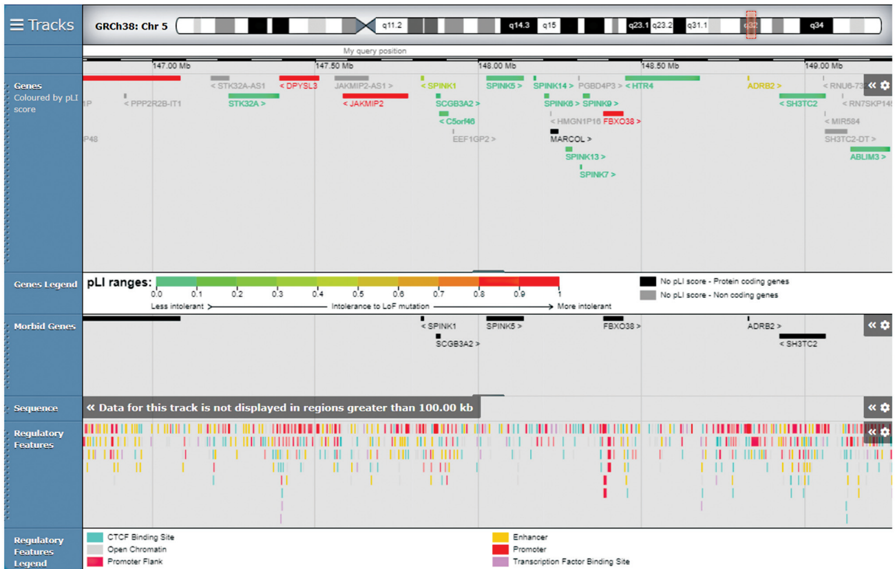
Fig. 2 Modified from SFARI genes, you can see SPINK5 involved with high confidence.

Infections are often reported in patients with NS. Bellon et al found cutaneous bacterial infections (mainly Staphylococcus aureus and Pseudomonas aeruginosa ) in 27 among 43 children affected by the disease. 9 It emphasizes that NS is a systemic genodermatosis that requires rigorous care procedures especially in the first year of life. In addition, comorbidities such as gastrointestinal, endocrinal, pulmonary involvement are reported in literature, with high incidence of severe metabolic anomalies. 9 The failure to thrive and chronic non-infectious diarrhea, observed in severe NS forms, might be partly related to abnormal digestive permeability and absorption as SPINK5 mRNAs are expressed in the gastrointestinal tract. 19,20