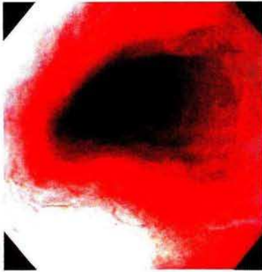
Figure 3: Endoscopic appearance of the mid-esophagus, showing ulcer healing after treatment.

nation therapy. Ileal lesions with Behçet's syndrome usually appear as deep punched-out ulcers (5). We speculated that the differences in therapeutic response between the esophagus and ileum may reflect the depth of the ulcers. Why ulcerations should be more shallow in the esophagus than in the ileocecum in Behçet's disease is unclear. The findings in the present case suggest that combination therapy with SASP and prednisolone may be particularly effective against esophageal involvement. As the likelihood of recurrence despite combination therapy is unclear, patients with this type of Behçet's disease require careful follow-up.