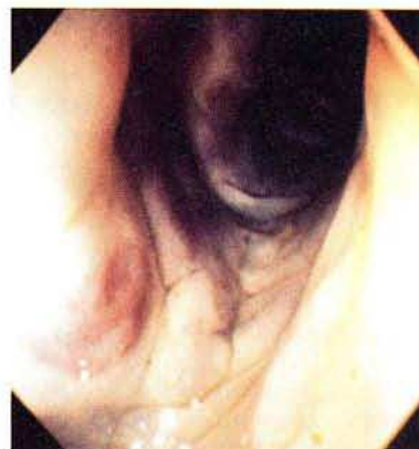
Figure 2: A repeat colonoscopy shows that the sigmoid colon has pale, edematous mucosa with petechiae and irregularly shaped nodules, and is lacking in distensibility.