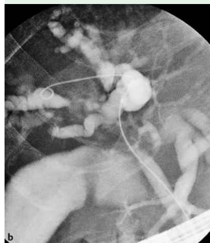
Fig. 1 a Cholangiography showed the left hepatic duct and the right anterior branch of the right hepatic duct. The bifurcation of the right anterior branch at S5 and S8 was invaded by the tumor. The right posterior branch is not opacified in this figure. b After identifying the right posterior branch with the guide wire, the cannula was advanced and the branch was visualized.