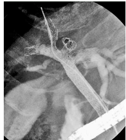
Fig. 2 Four JoStent SelfX stents were deployed – in the left lateral segment, the right posterior segment, and in the S5 and S8 branches of the right anterior segment branch, using the partial stent-in-stent procedure.