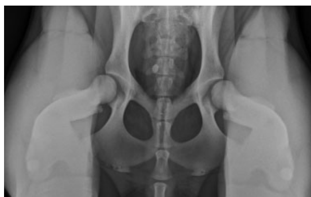
Fig. 2 Example of the distension view obtained with the VMBDD (Vezzoni modified Badertscher distension device). Note the clear lateral displacement of the caput femoris. Compared with PennHIP, the hindlimbs are slightly more extended.

observer (comparison 1) or technique (comparisons 2 and 3) as fixed effect. If a fixed effect in this model was significant, this implies a consistent bias. To evaluate the variability, random effects models were used with patient and side (left or right) within patient as random effect. The residual standard deviation (SD) of this model provides a direct value for the variability as defined earlier. All comparisons up until