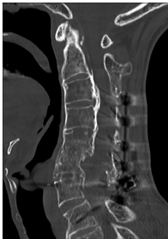
Figure 3: Computed tomography image 6 months postoperatively: Midline sagittal image

no neurological improvement was observed up to 3 years postoperatively.