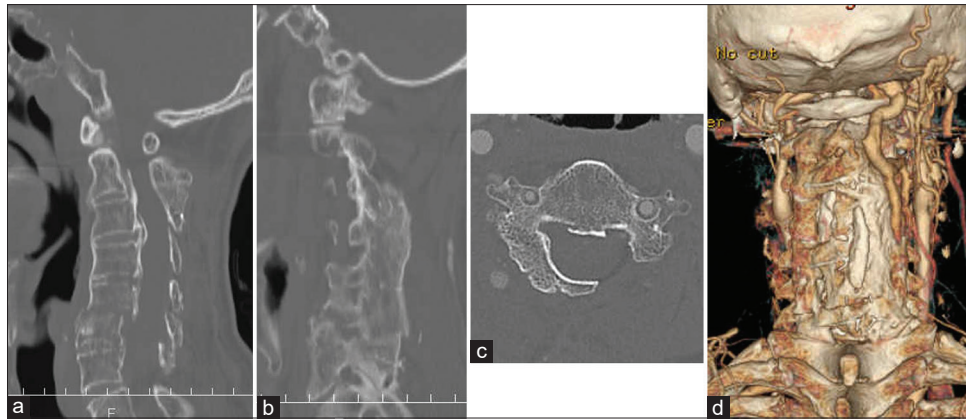
Figure 1: Initial computed tomography image. (a) Midline sagittal image. (b) Parasagittal image. (c) Axial view. (d) Three-dimensional computed tomography