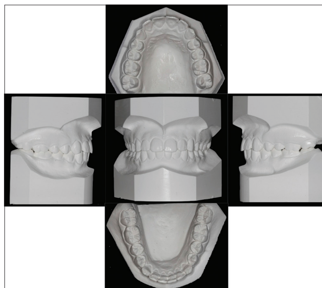
Figure 2: Molar relationships with a Class I occlusion case was presented and passed in the American Board of Orthodontics