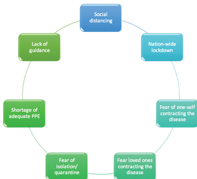
Figure 1: Factors influencing morale during the COVID-19 pandemic

Looking at the present scenario, India is presently demonstrating a community spread of COVID-19 and there is very little certainty of how this pandemic is going to unfold here further. A large part of the psychological responses has so far been reactionary to what has happened in other countries in the world, fears of what might be in store in the times ahead and responses to the lockdown. Here we discuss the psychological impact of COVID-19 on the radiology department on both the front liner radiographers, and the radiologists serving as the backbone.