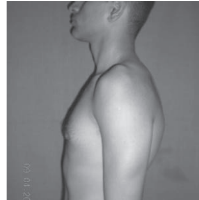
Fig 2 : Wasting of left deltoid

Backpack brachial palsy is an uncommon injury presumably caused by constant pressure by shoulder