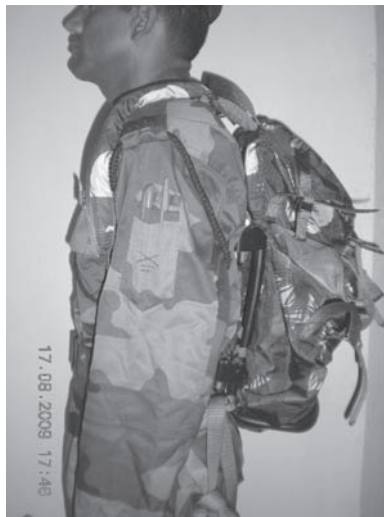
Fig 1 : Backpack worn by the soldier

A 19-year-old military recruit presented with pain and weakness of left upper limb of 2 weeks duration. He had been well till about 2 weeks back, when he was on a routine cross country training exercise. During the exercise lasting four days, he was carrying a backpack continuously weighing 15.5 kg (Fig 1). He denied any history of fall or trauma to left shoulder. Examination revealed a well-built individual. General physical examination was essentially normal. Examination of left upper limb showed wasting of shoulder, arm, forearm and hand muscles. Wasting was more apparent in left