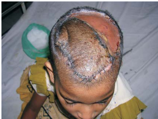
Fig 4: Postoperative photograph of the patient

and fungating brain matter visible. Debridement of the bone was done to define the dura. The infected portion of the dura was removed and stay sutures were applied. The fungated brain matter was excised followed by