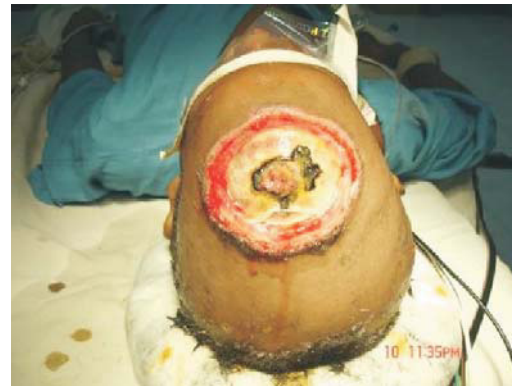
Fig 1: Clinical photograph showing the scalp wound

On examination she had 12 x 8 cm scalp loss with charred area on the vertex bone with foul smell and fungation of brain matter (Fig 1). There were no systemic signs and symptoms of meningitis or any other neurological deficit.