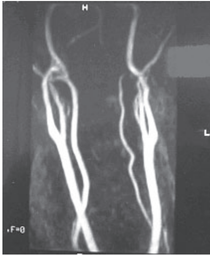
FIGURE 3. MR angiography showing normal caliber neck vessels

infarction. There was no involvement of brainstem. MR angiography of the neck vessels was normal (Fig 3).