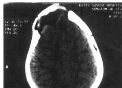
FIGURE 1 : CT showing leptomeningeal cyst with loculated CSF, Cerebromeningeal cicatrix

CT Brain (Fig 1) Showed leptomeningeal cyst with thick & everted bony margins. Contents of the cyst were CSF and cerebro-meningeal cicatrix. A piece of bone was seen at the centre of cyst, which was probably a free bone fragment detached at the time of monkey bite (Fig 2).