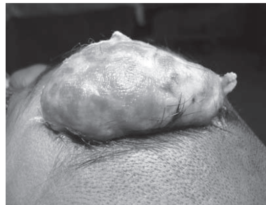
Fig 1 A, B & C: Fungating left frontal lobe.