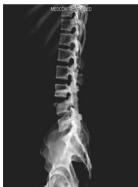
Fig 2: Reconstructed noncontrast CT scan of LS spine showing instruments in situ with normal alignment achieved postoperatively in the patient shown in Fig 1.