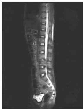
Fig 1: Burst fracture L4 vertebral body with spinal canal compromise. T2 weighted MRI image.

Fourty four percent (n = 11) improved on continued follow up till August 2010 and 16% (n = 4) improved