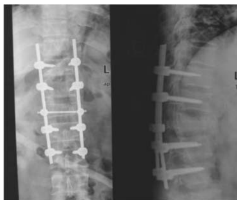
Fig 6: Postoperative radiograph showing implants in situ with normal alignment