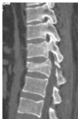
Fig 5: CT showing burst fracture D11