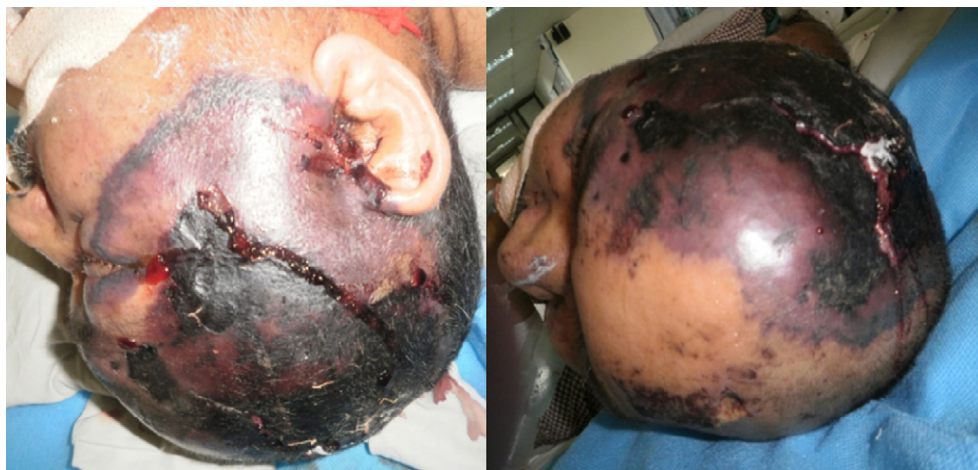
Fig. 1 – Photographs showing lacerated wound and well demarcated scalp necrosis.