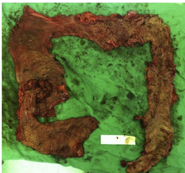
Fig. 3 – Product of a total colectomy: 62 hamartomatous polyps.

greater than 5 mm. 14,15 The use of capsule endoscopy is considered as a good method for searching the small intestine. 16 Another less expensive but less sensitive option is the CT scan with oral contrast. 17 The double-balloon enteroscopy is a great option, when therapeutically associated; but this procedure is too invasive for control or scanning procedures. 2