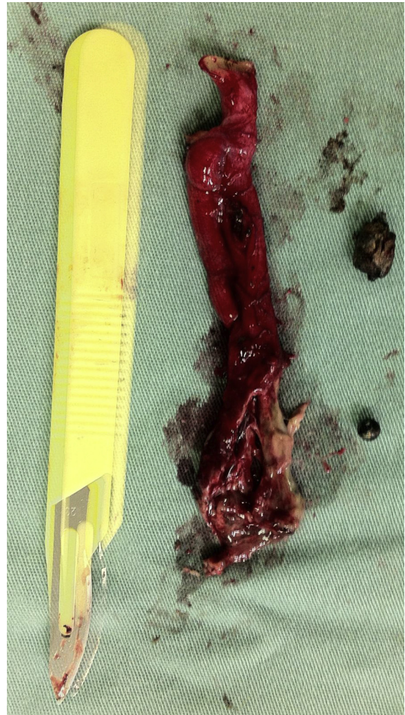
Fig. 4 – Appendix and foreign bodies.

was discharged on the 5th postoperative day, with acceptance of a general diet and with normal bowel habits.