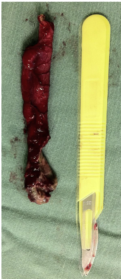
Fig. 3 – Vermiform appendix.