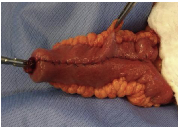
Fig. 2 – Ileal J-pouch with 15 cm extension, fashioned with mechanical sutures and placement of the pointed arch of the stapler for ileoanal anastomosis (pouch-anus) by a double stapling technique. Restorative proctocolectomy and ileal pouch anal anastomosis in patients with Familial adenomatous polyposis are shown.

For TC, approximately 15 cm of rectum was preserved, followed by performing primary IRA end-to-end with a 29 mm circular stapler. TPC consisted of resection of the colon and rectum, followed by reconstruction of a means of intestinal transit with a mechanical bowel anastomosis by a double stapling technique involving fashioning an 15 cm ileal J-pouch using two staplings of 75 mm and anastomosing this pouch to the anal canal with a 29 mm circular stapler. In these, protective ileostomy was performed and also routine drainage (Fig. 2).