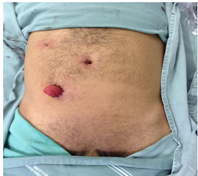
Fig. 4 – Final appearance.

In 2013, McLemore held TAEF using minimally invasive transanal surgery (TAMIS) in a series of 5 human corpses (all male), with a surgical time of 200 (128-249) min. In the perianal time, this author used GelPOINT-Path; in the abdominal