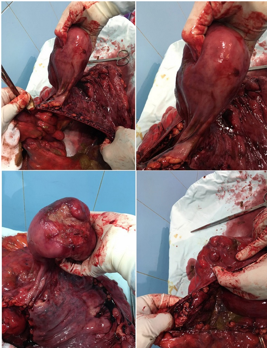
Fig. 3 - The removed sections of sigmoid and upper rectum.