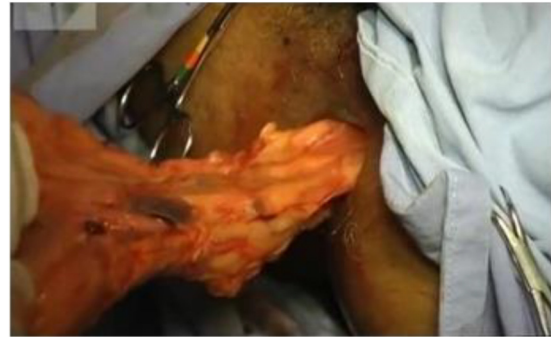
Fig. 3 – Transanal surgical specimen removal.

Dublin, Ireland). In these cases, shortly after the specimen removal, suture in the remnant colon bag was performed and the stapler warhead was fixed. The EEA HEM ® anoscope portal was then placed and fixed to the skin and the distal stump pouch was sutured. Finally, the warhead was attached, followed by the stapler closure (Fig. 4a-c), and the pneumoperitoneum was redone. The position of the lowered colon was checked and a final revision of the abdominal cavity was performed, as well as the repair of the ileum loop to make a protective ileostomy. Then, pneumoperitoneum was undone, stapling was performed, and stapled line was checked, transanally, in order to make reinforcement and/or hemostatic points whenever necessary.