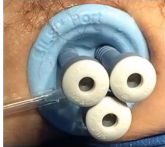
Fig. 2 – SILS ™ Port device inserted.

In 8 cases it was possible to perform stapled anastomosis with EEA HEM ® 33 mm–4.8 mm stapler (Medtronic Inc,