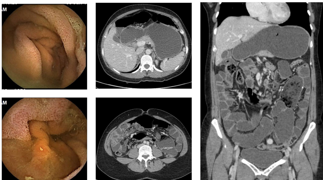
Fig. 2 – Capsule endoscopy and CT enterography images, 6 months after the acute event. Signs of pneumatosis are absent with few enteric stasis near the enteric anastomosis in CT enterography.

There are several theories to explain the secondary PCI pathogenesis 8 : mechanical theory, bacterial theory, pulmonary theory, and chemical theory. The mechanical theory suggests existence of air inflow through damaged mucosa, caused by intestinal obstruction, severe constipation, gastrointestinal ulcers, or intestinal necrosis, resulting in increased intestinal pressure. The bacterial theory suggests the invasion of gas-producing bacteria into intestinal submucosa, producing gas at the intestinal walls. The pulmonary