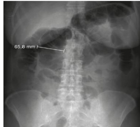
Fig. 2 – Plain abdominal radiography showing dilatation of the transverse colon.

The diagnosis of TM is established when we had 3 of the 4 criteria below: 1) Temperature > 38.6 °C, 2) Tachycardia (> 120 bpm), 3) Leukocyte count > 10,500 mm 3 with left shift, and 4) Anemia (hemoglobin or hematocrit < 60 % of normal) (Table 1). 8,9