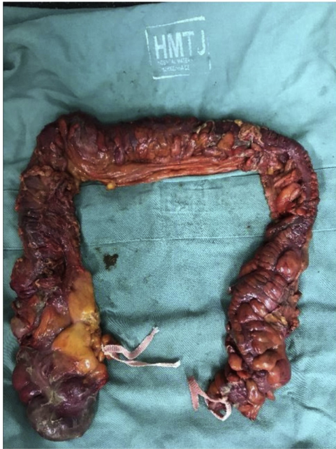
Fig. 1 – Operative specimen of proctocolectomy for toxic megacolon.