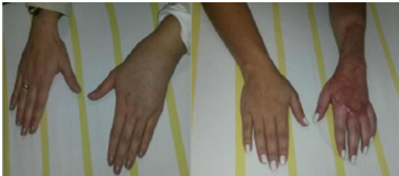
Fig. 1 A, admission; B, 1 st month after the surgery.

Depending on the degree of cellularity, nuclear pleomorphism, and mitotic activity, myxofibrosarcomas are classified into three histological grades: low, intermediate, and high grade. 1,2 In the present case, the nonspecific physical and imaging features initially led to the misdiagnosis of a benign lesion, delaying treatment for > 2 years. The MRI scans showed characteristic images, such as the high signal in T2-weighted images seen in myxoid tumors, and a low signal in those with fibrosis. Although the nuclear magnetic resonance (NMR) findings did not confirm the diagnosis, they helped the surgical planning.