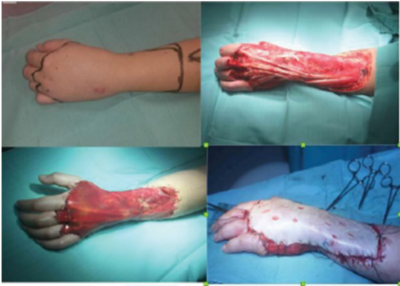
Fig. 4 Transoperative period of tumor resection. A, intraoperative marking; B, wide resection; C, reconstruction with dermal matrix; D, second surgical time with total skin graft.