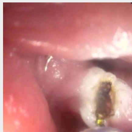
► Video 1 Thulium-laser assisted cricopharyngeal myotomy.

125 min). The initial emission power was set 10W for the mucosal layer and then increased to 16W for the myotomy. The total amount of energy delivered and the laser time are summarized in ► Table 1 . The two patients with recurrent diverticulum required an energy delivery > 10,000 Joules. The procedure was assisted by a transparent cap in three patients, a flexible overtube in one, and the Weerda diverticuloscope in one. The postoperative course was uneventful in all patients and no cervical emphysema or fever were recorded. The chest film and the gastrographin swallow study on postoperative Day 1 did not show evidence of pneumomediastinum, leaks or residual pouch (► Fig. 2 ). Patients were discharged home within 48 hours on a soft diet. At 1- and 3-month follow-up visits all patients were satisfied with the procedure and reported improved swallowing and absence of regurgitation and cough.