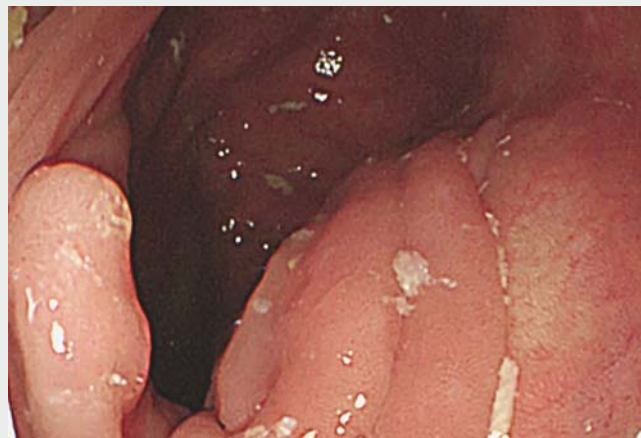
► Video 1 An Endocuff was placed on the top of the endoscope to allow the lesion to be viewed using forward observation. The water-filling process was effective in helping to acquire better visualization and allowing the lesion to be grasped with a snare.

We conclude that underwater polypectomy using Endocuff assistance to treat neoplasms located only in the hepatic or splenic flexure may be considered an effective method for endoluminal treatment of complex lesions.