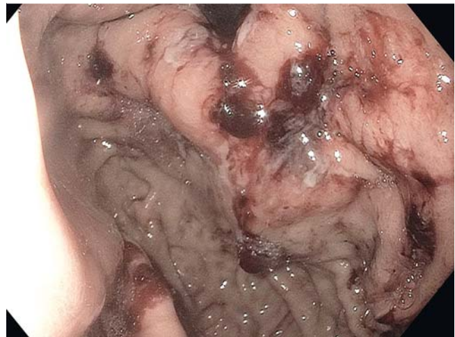
► Fig. 2 Successful 270 degree fundoplication.

All procedures were performed under general anesthesia by endoscopists (AT, MK) with expertise in performing TIF. Pre-procedural antibiotics were given in all cases. A flexible endoscope (GIFH 190; Olympus; Center Valley, PA, United States) was used to evaluate the esophagus and assess for a hiatal hernia before the procedure. The Esophyx Z device (Endogastric Solutions; Redmond, WA, United States) was then introduced transorally over a flexible endoscope (GIF-XP190, Olympus) into the stomach. The endoscope was retroflexed and the plastic jaw was advanced fully into the stomach under direct visualiza-